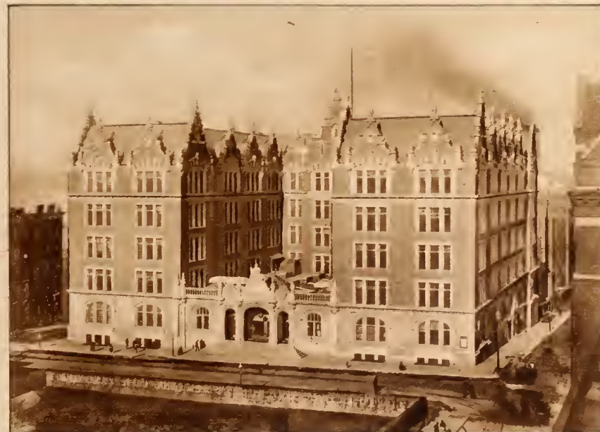
DE WITT CLINTON HIGH SCHOOL, 59th Street and 10th Avenue.